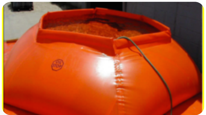
Liquid Storage Systems