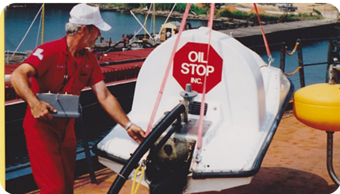
Remote Controlled Vessels

Oil Stop specializes in complete package systems with equipment for containment, recovery, storage and decontamination. We offer a full range of oil spill control equipment and complete system packages including oil spill containment booms, liquid storage devices, oil skimmers, boom reels, power packs, inflation blowers, storage containers, and trailers.