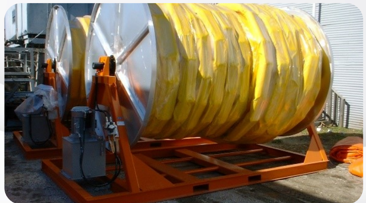
Solid Flotation and Permanent 'Husky' Booms